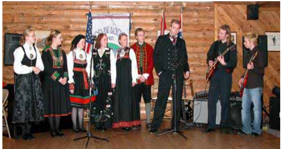
Students from Valle Vidaregåande Skule in Setesdal will perform at Normanna Hall on February 23, starting with a potluck at 6:30pm